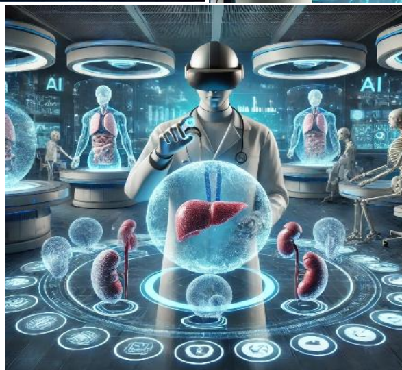
Figures 2-3-4. The Future of Experimental Surgery with AI