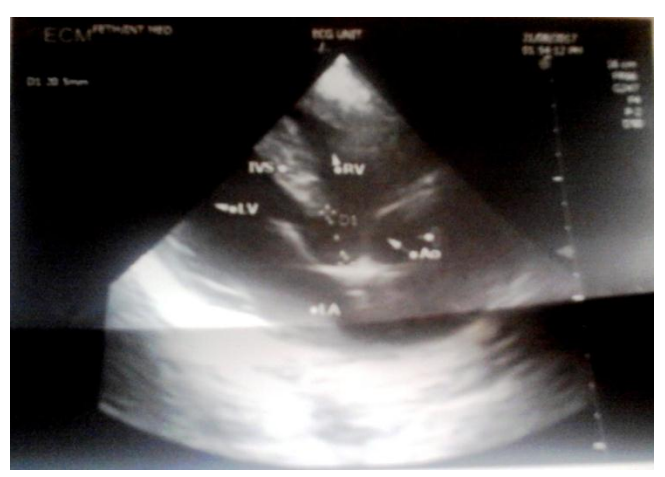
Figure 3 showing echocardiogram of an adult patient with Tetralogy of Fallot

Echocardiography (figure 3) showed: a membranous ventricular septal defect measuring 1.9cm with a bi-directional colour flow and an overriding dilated aorta (with aortic diameter of 3.9cm), interventricular septal wall hypertrophy of 1.6cm in diastole, and normal left atrial (2.2cm) and left ventricular cavity (4.4cm) with a slightly depressed left ventricular ejection fraction (52%). There was also right ventricular hypertrophy (RVH) with the right ventricular free wall of 12cm, and a normal longitudinal function with a tricuspid annular systolic excursion (TAPSE-1.36cm); dilated right atrium (RA) with an area of 25.2 cm²and dilated inferior venal cava (IVC-2.96cm) with less than 50% collapse during inspiration. The pulmonary valve was thickened with a small pulmonary artery. The pulse wave was reversed in both right and left ventricular inflow.