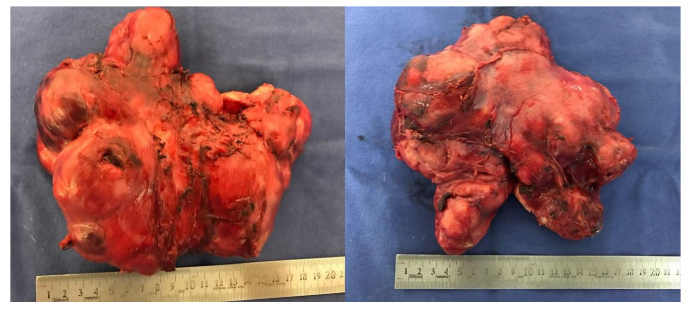
Figure 3: Resected tumor mass.