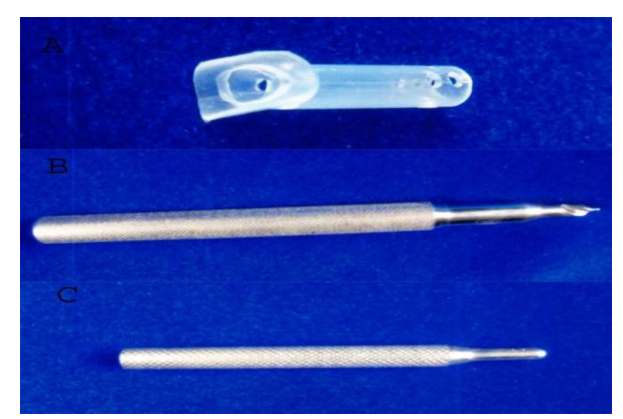
Figure 1A: Pawar's intracystic implant; 1B. Special perforator; 1C. Pawar's intracystic implant introducer

It is made up of medical grade silicone elastomer providing maximum tissue compatibility and minimum thrombogenicity. The length of implant varies from 12 mm to 17 mm with an external diameter 3 mm and an internal diameter of 2.5 mm (figure 1A). The implant has a collar of size 8 mm vertically and 5 mm horizontally, which rest on the lacrimal sac cavity. Implants are provided with 4 holes at the upper end near collar and 6 holes at the lower ends 5 mm prior to distal end. They act as extra drainage channel having 1 mm diameter. This Pawar's implant is supplied as gamma rays sterilized packet containing single piece.