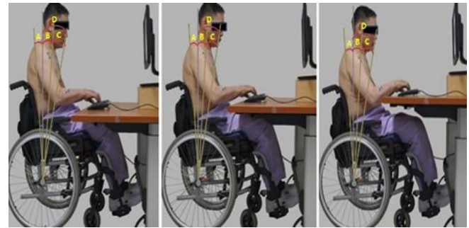
Figure 3: Comparison of T6 subject's lateral posture according to the height of the worktable

The wheelchair centerline and ear tragus angle, and wheelchair centerline and chin tip angle were compared in patients with C6