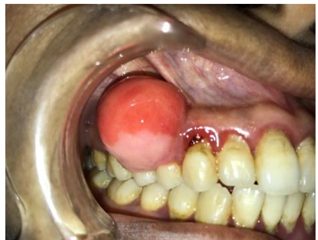
Fig. 1 Pre-operative View: Sessile mass located in the buccal gum mucosa in the region of 14,15 and 16.

16 on the buccal side, measuring approximately 2 x 2 cm in diameter, extending from mesial surface of 14 to mesial surface of 16 (Figure 1).