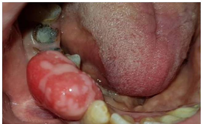
Fig. 6: Pre-operative View: Sessil mass located in the buccal gum mucosa in the region of 44,45 and 46.