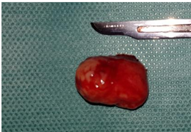
Fig. 8: The excised lesion specimen