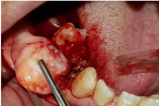
Fig. 7: Per-operative view showing the sessile aspect of the lesion.

An excisional biopsy was performed. Under local anaesthesia, excisional biopsy was performed, followed by a surgical flap raised to complete the excisional mass biopsy (Figure 7, 8 and 9).