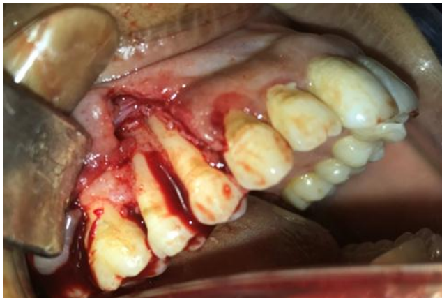
Fig. 3: Per-operative view: Surgical flap raised to complete the excisional mass biopsy.

Based on the clinical and radiological data, the provisional diagnosis made was focal fibrous hyperplasia. Differential diagnosis was given, and has included the following chronic fibrous epulis, osteosarcoma and pyogenic granuloma. An excisional biopsy was performed. Under local anaesthesia, excisional biopsy was performed, followed by a surgical flap raised to complete the excisional mass biopsy (Figure 3) and then, analysed under microscope.