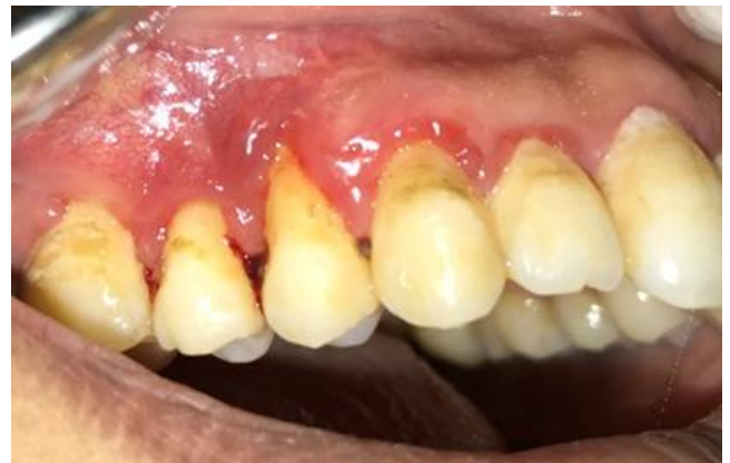
Fig 5: Follow-up after 15 days: complete healing with no sign of Recurrence.

diagnosis for the lesion. The patient was followed-up during a period of 15 days and showed a complete healing with no sign of recurrence (Figure 5).