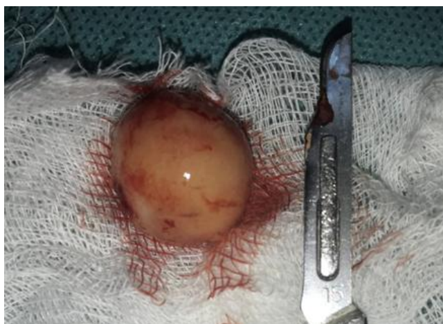
Fig. 4: The excised lesion specimen

Different sizes of multiple foci of same calcified areas within connective tissue has been revealed. Thus, the histological examination concluded a focal fibrous hyperplasia as final