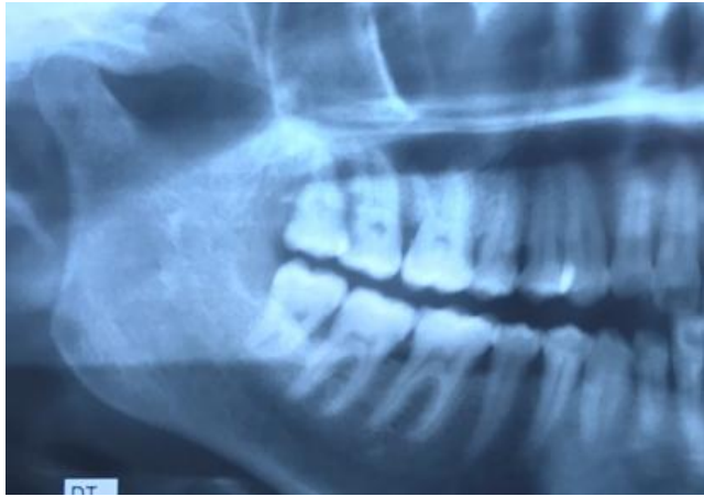
Fig. 2: Bone resorption in front of the papillar region between 14-15-16.

Based on the clinical and radiological data, the provisional diagnosis made was focal fibrous hyperplasia. Differential diagnosis was given, and has included the following chronic fibrous epulis, osteosarcoma and pyogenic granuloma. An excisional biopsy was performed. Under local anaesthesia, excisional biopsy was performed, followed by a surgical flap raised to complete the excisional mass biopsy (Figure 3) and then, analysed under microscope.