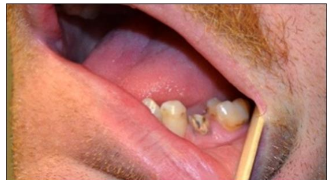
Figure 1: Pre-operative picture of teeth #20 which had previous RCT

coronal tooth structure with the cast metal post and core and prosthetic restoration using the same crown. During the first visit, post space was created with the slow hand piece and the impression was taken with the Polyvinyl siloxane (PVS) light and heavy body impression material. The impression was sent to the lab along with the existing crown. Detailed discussion with the lab technician was done from time to time and progress was monitored. After 2 weeks, patient was scheduled for an appointment. The crown internal fitting and the occlusion was checked and after making sure everything was adequate, cast metal post and crown was cemented with the resin based dual core cement material. High points were checked with the articulating paper. Patient was followed up after 2 weeks of crown placement, thereafter; follow-up visits were scheduled at 3 months, and 6-months. Clinical and radio graphical findings suggested good periodontal condition and no pain was reported. Patient satisfaction was measured on the visual analogue scale as 10/10.