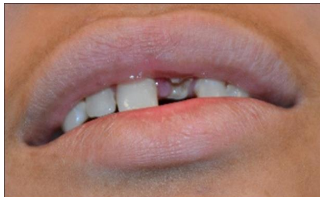
Figure 6: Pre-operative picture of a #9 which is previous RCT that subsequently failed.

post and core instead of fiber post. The shoulder margin was too deep, so we had to perform gingivectomy along the circumference of the tooth and also performed crown lengthening. Prosthetic restoration was made with a monolithic zirconia crown and patient was followed up twice in 6 months and graded the satisfaction as 10/10 on a visual analogue scale.