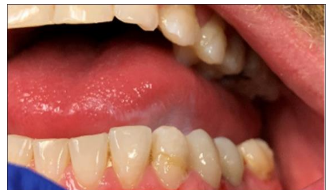
Figure 2: Post-operative picture of Re-treated RCT with cast post and core with final full coverage crown.