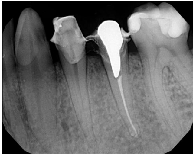
Figure 4: Radiograph with tooth #20 with restoration of a cast post and core