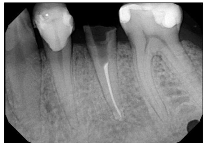
Figure 3: Radiograph with tooth #20 with preparation for post and core.