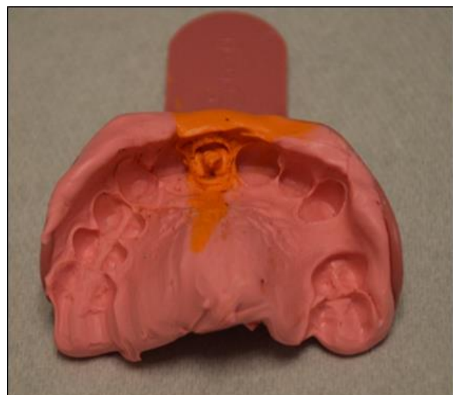
Figure 7: Impression made with PVS light and heavy body impression material for designing the post and core.