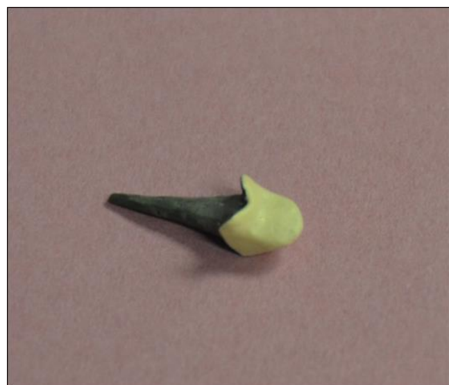
Figure 8: Image of a cast/customized metal Post and core