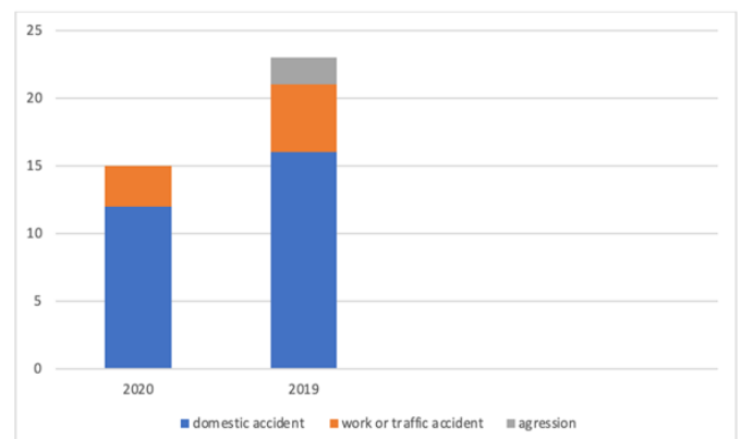
Figure 2: Causes comparison

The domestic accident was the principal cause of burns in both 2020 and 2019 (80% and 74%). (Figure 2)