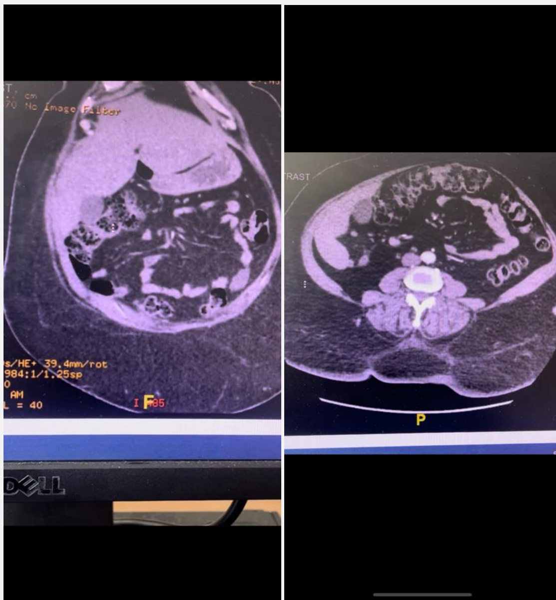
Figure 1: CT scan showing sub-hepatic appendix

The patient was taken to the operating room (OR) for Diagnostic Laparoscopy after antibiotic and thromboembolism prophylaxis, Insufflation was done with Verus Needle at Palmer point, the abdomen was entered 3 Ports in order to have good access to the