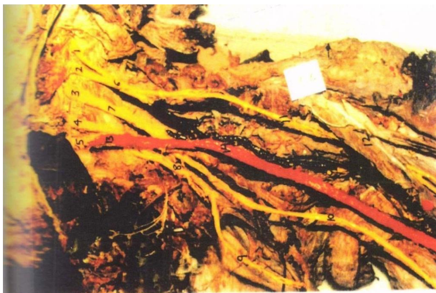
1-C5,2-C6,3-C7,4-C8,5-T1(first thoracic root),6-upper trunk,7-middle trunk,8-lower trunk,9-Ulnar nerve,10-median nerve,11-musculocutaneous nerve ,12-coracobrachialis muscle ,13-subclavian artery,14-axillary artery