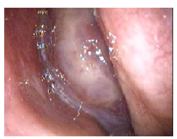
Figure 1: Mass seen in the left nasal cavity.

continuing with soft tissue density in the left half of the frontal sinus (Figure 2, 3). Punch biopsy was taken from the lession with local anesthesia. Then, general anesthesia was performed to remove whole lession endoscopically. There was more bleeding than expected during the operation and bleeding was controlled with bipolar cautery during the operation. The postoperative pathology report was compatible with hemangioperistoma. No recurrence was observed in the follow-up period of 2 years.