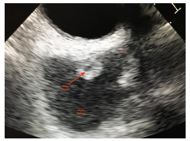
Figure 2: Same patient cross sectional short axis (Figure 2), showed the central circular lumen formed around the external surface of the catheter. The biomass is in the superior vena cava and extends into the right atrium.

Different but converging lines of evidence hint that catheters themselves may trigger downstream biologic responses not fully appreciated but perhaps important contributors to immunoinflammatory dysregulation.<sup>[46,53-56]</sup> For many years nephrologists have observed that albumin levels inversely correlate with hemodialysis catheter use and may result from heightened inflammation.<sup>[51,56]</sup> In fact, implanting a dialysis catheter has been demonstrated to be significantly correlated to higher C-reactive protein levels, while after catheter removal, these elevations return to baseline levels.<sup>[51,56]</sup> These results suggest that the presence of a hemodialysis catheter is an independent determinant of an exaggerated inflammatory response in CKD requiring hemodialysis. Alternatively, these higher C-reactive protein levels could reflect the spectrum of disparate etiologies of pre-existing CKD, independent of catheter use. Regardless, these data have required reexamination of long-held views that previously regarded catheter use as innocuous. The subtle and often unforeseen cellular communication directly related to immunoinflammatory stress within the vascular microenvironment may have profound effects.