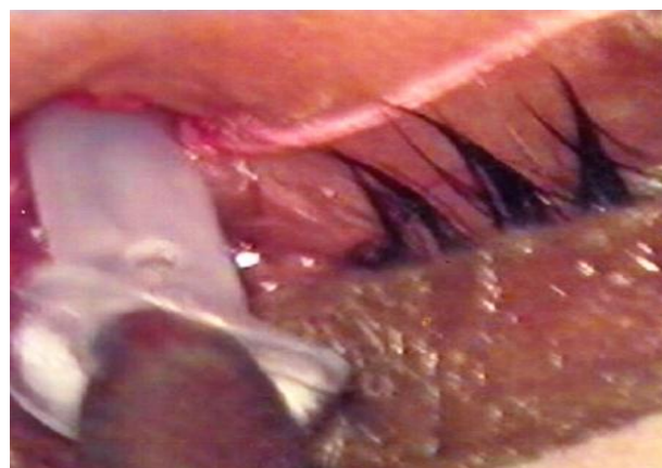
Figure 2: Placement of implant inside newly formed lacrimal bony ostium

A 5-6 mm long curved incision was made 3 mm medial to the inner canthus. Exposure of the sac was done without cutting medial canthal ligament. A full thickness 4 mm long incision was made on anterolateral wall of sac using 11 number surgical blades. Sac cavity was irrigated with saline and 5% Providone solution. An ostium was created, using a special perforator, in the lower part of lacrimal fossa. The perforator is passed through posteromedial wall of sac, lacrimal bone and nasal mucosa to make a passage in the middle meatus of nose. The tip of special perforator points towards posteromedial and lower direction in relation to the sac. A sterilized Pawar's intracystic implant was introduced through this newly fashioned ostium with a special introducer (Figure 2). The wider portion (collar) lies on the sac cavity and other end in the middle meatus of the nose. The introduced implant is irrigated with normal saline and 5% Providone iodine solution. Syringing was done to confirm patency. The wound was closed in layers using 6-0 chromic catgut suture.