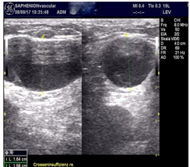
Fig.3: Sealing ectatic and aneurysmatic parts of truncal veins is also possible with a little bit more of glue - also these cases didn't show any allergic reactions.

Of course, as with any drug, an explanation of the problem of a possible allergy must be made. However, the risk of actually developing allergic reactions is negligible in sealing veins. This must be communicated in any case. A blanket suspicion of allergic side effects is completely out of place.