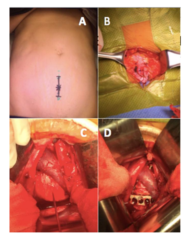
Figure 1: Anterior Lumbar interbody fusion (ALIF) steps: A. infraumbilical middle line 4-5cm skin incision is marked, B. Locate anterior aponeurosis, rectus abdominis, mobilized the contents of the abdominal cavity and exposed the lateral landmark the psoas muscle. C. The next lateral landmark to identify of the level L5-S1 is the iliac vessels, the discectomy is later performed. D. Finally the stand alone lordotic cage is placed in the worked space.

and secure into the vertebral body with 4 screws through standalone mechanism. In some cases tanspedicular posterior percutaneous screws they were required for the end of the procedure (Figure 1.)