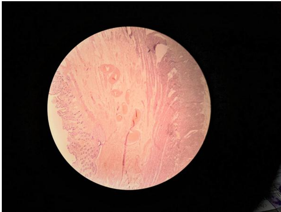
Figure 6: Histopathology side of stricture segment showing inflammatory infiltrates in the mucosa, submucosa with oedema, congestion and haemorrhages.