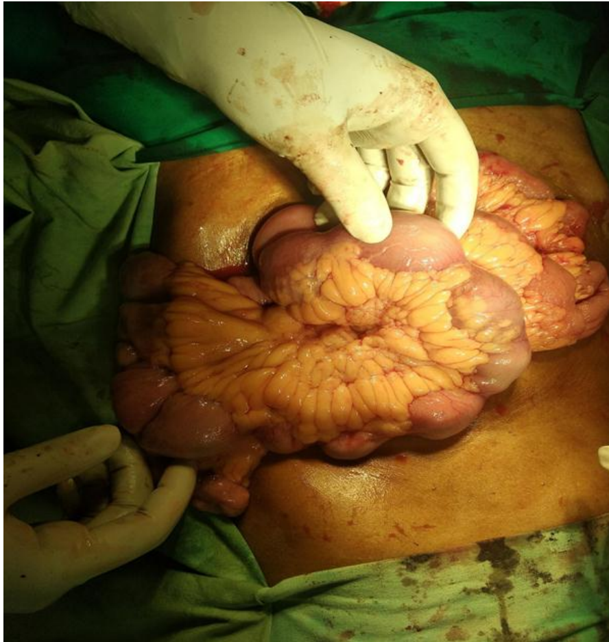
Figure 3: Intraoperative strictures small bowel segment.

Resection anastomosis of mid ileal segment was done and sample was sent for histopathology. One of the constricted segments had