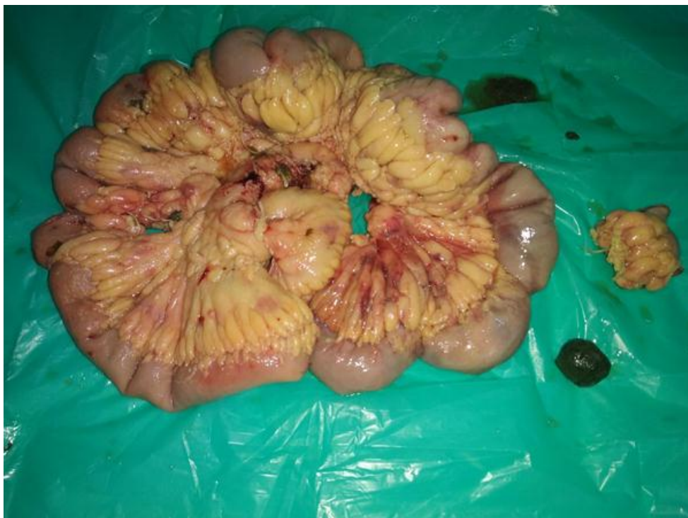
Figure 4: Showing resected strictures small bowel segment with 3.2cm*2.5cm*3cm dimension grey coloured enterolith.

an enterolith of 3.2cmx2.5cmx3 cm which was hard in consistency.