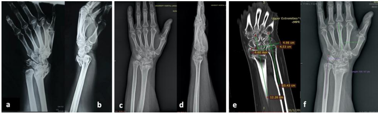
Figure 1: x-rays of the distal radius fracture in a 67-year-old female (a, b). Conservative treatment of the fracture by plaster immobilization resulted in a malunion as it is showed in 6-month follow-up x-rays (c, d). There is loss of radius height and ulna plus deformity of more than 6mm (e) while DRUJ diastasis drives to increased carpal translation index though the carpus is well centralized on the radius.

On the clinical examination, there was tenderness at the dorsal aspect of the wrist especially at the distal radioulnar joint (DRUJ) and decreased, painful range of movement at wrist including forearm pronation-supination. Hand was fixed in an ulnarly deviated position. Patient complained about numbness, dysesthesia and decreased sensation in the area of distribution of both median and ulnar nerve (all fingers) with no findings of motor impairment. She reported no history of pain or any type of sensory impairment in hand prior the injury.