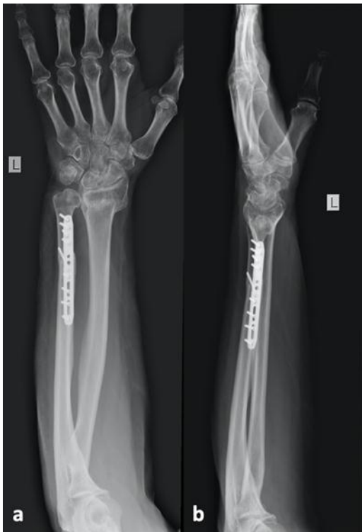
Figure 3: x-rays at 1-year follow-up.

at the disarranged radius sigmoid notch due to distal radius fracture malunion. Concerning the nerve compression symptoms, partial improvement of numbness was reported, but not complete recovery. Of course, there were still no motor symptoms. At the 3-month follow-up, there was significant improvement of ulnar nerve's sensory function and no snapping sensation in DRUJ. One year postoperatively, x-rays of the forearm and wrist show complete healing of ulna osteotomy and better positioning of radius and ulna, concerning DRU joint (figure 3). The functional result was satisfactory with (PRWE) Patient Rated Wrist Evaluation score 12/100 and Green and O'Brien (Cooney et al. modification) scoring system 85 (good). There was no sign of ulnar nerve compression neuropathy (numbness or sensory deficit).