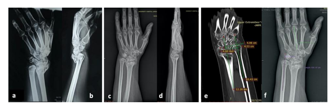
Figure 1: x-rays of the distal radius fracture in a 67-year-old female (a, b). Conservative treatment of the fracture by plaster immobilization resulted in a malunion as it is showed in 6-month follow-up x-rays (c, d). There is loss of radius height and ulna plus deformity of more than 6mm (e) while DRUJ diastasis drives to increased carpal translation index though the carpus is well centralized on the radius.

On the clinical examination, there was tenderness at the dorsal aspect of the wrist especially at the distal radioulnar joint (DRUJ) and decreased, painful range of movement at wrist including forearm pronation-supination. Hand was fixed in an ulnarly deviated position. Patient complained about numbness, dysesthesia and decreased sensation in the area of distribution of both median and ulnar nerve (all fingers) with no findings of motor impairment. She reported no history of pain or any type of sensory impairment in hand prior the injury.