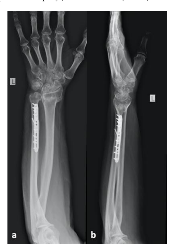
Figure 3: x-rays at 1-year follow-up.

at the disarranged radius sigmoid notch due to distal radius fracture malunion. Concerning the nerve compression symptoms, partial improvement of numbness was reported, but not complete recovery. Of course, there were still no motor symptoms. At the 3-month follow-up, there was significant improvement of ulnar nerve's sensory function and no snapping sensation in DRUJ. One year postoperatively, x-rays of the forearm and wrist show complete healing of ulna osteotomy and better positioning of radius and ulna, concerning DRU joint (figure 3). The functional result was satisfactory with (PRWE) Patient Rated Wrist Evaluation score 12/100 and Green and O'Brien (Cooney et al. modification) scoring system 85 (good). There was no sign of ulnar nerve compression neuropathy (numbness or sensory deficit).