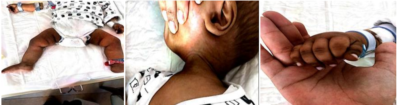
Figure 2: Depicted below are the child's pictures.

Keywords: Vitamin b12 deficiency, Paeditric, Anaemia, pancytopenia, Saudi Arabia.