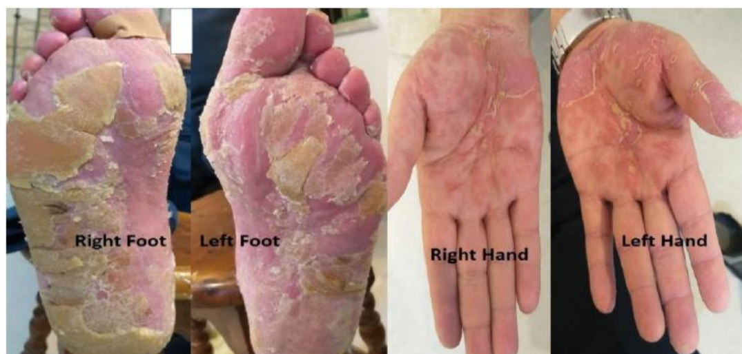
Figure 3: PPK of the hands and foots soon after stopping pembrolizumab and initiating dermatological treatment.