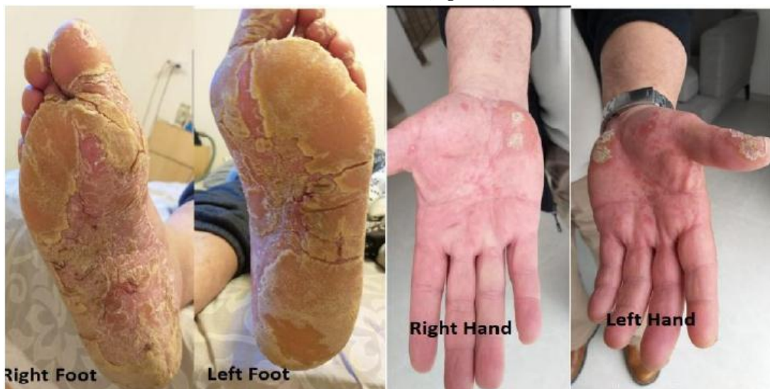
Figure 2: PPK of the hands and feet before stopping the pembrolizumab and initiating dermatological treatment.

The patient was referred again to the dermatologist and who initiated treatment with bifonazole urea cream (Keratospo TM ), topical salicylic acid 10%, and oral acitretin (Acitretin TM ) 25mg given once daily. Two months later the thickening of the skin in all extremities showed regression and pain was significantly resolved (Figure 4).