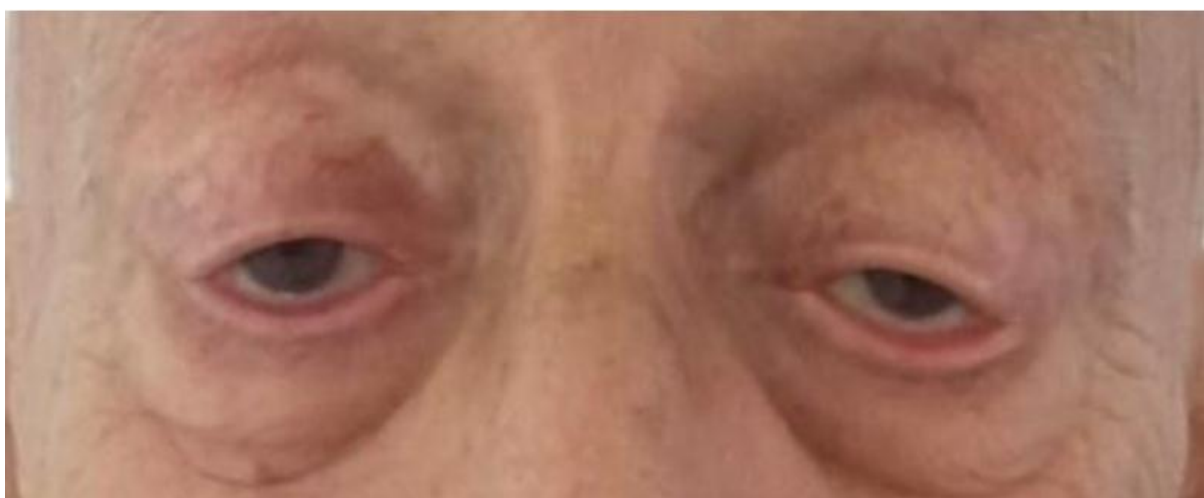
Figure 7: Improvement in the bilateral ptosis, after the second day of IV-IG treatment.