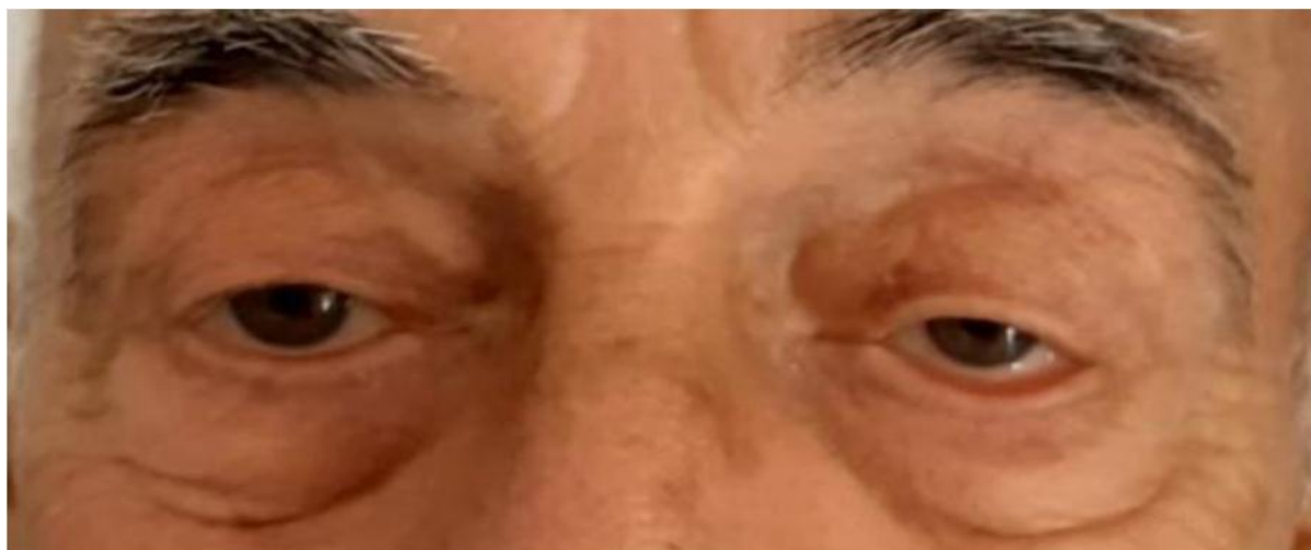
Figure 8: Improvement in the bilateral ptosis, after the fifth day of IV-IG treatment.