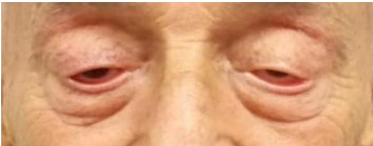
Figure 6: Minimal improvement in the bilateral ptosis after corticosteroid treatment.