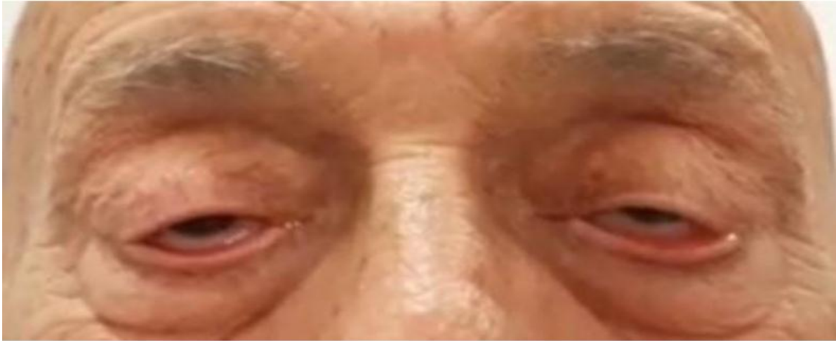
Figure 5: Bilateral ptosis, plus near complete ophthalmoplegia (at presentation)

Corticosteroid therapy was initiated and he was treated with prednisone (1mg/kg) for two weeks with minimal clinical improvement ( Figure 6 ). The patient was re-admitted to our department for treatment with IV-IG at 0.4mg/kg daily for 5 days. On the second day of IV-IG treatment, the ptosis improved and he was speaking more clearly ( Figure 7 and Figure 8 ). One week later the symptoms completely resolved.