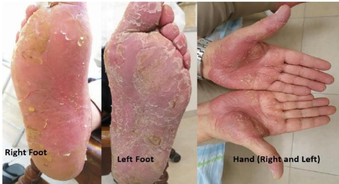
Figure 4: Improvement of PPK on the hands and feet while on dermatologic treatment.