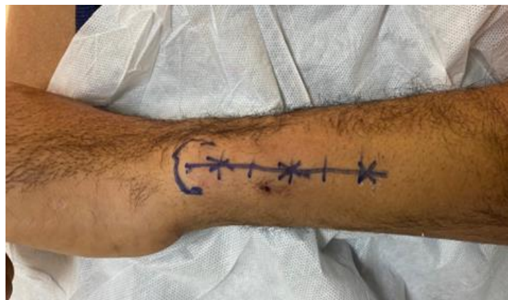
Figure 2: Approach marking for ulnar fracture. Subperiosteal injection points of the anaesthetic marked with red stars.

Table 3 summarizes the different results assessed. Through Figures 2 to 4, we present a visual depiction of the steps involved in the WALANT surgery performed on one of our patients.