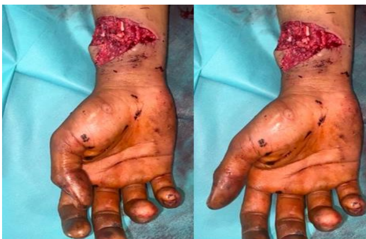
Figure 4: Assessing the intraoperative quality of the tendon suture following the repair of the flexor pollicis longus tendon using the WALANT technique.