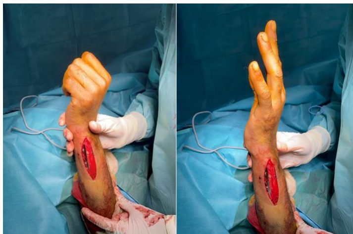
Figure 3: Verification of the stability of osteosynthesis during surgery to facilitate early rehabilitation.