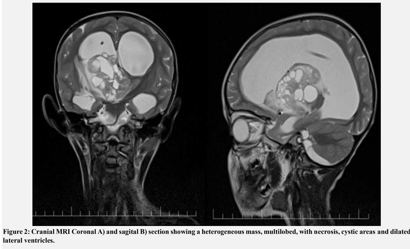
Figure 2: Cranial MRI Coronal A) and sagittal B) section showing a heterogeneous mass, multilobed, with necrosis, cystic areas and dilated lateral ventricles.